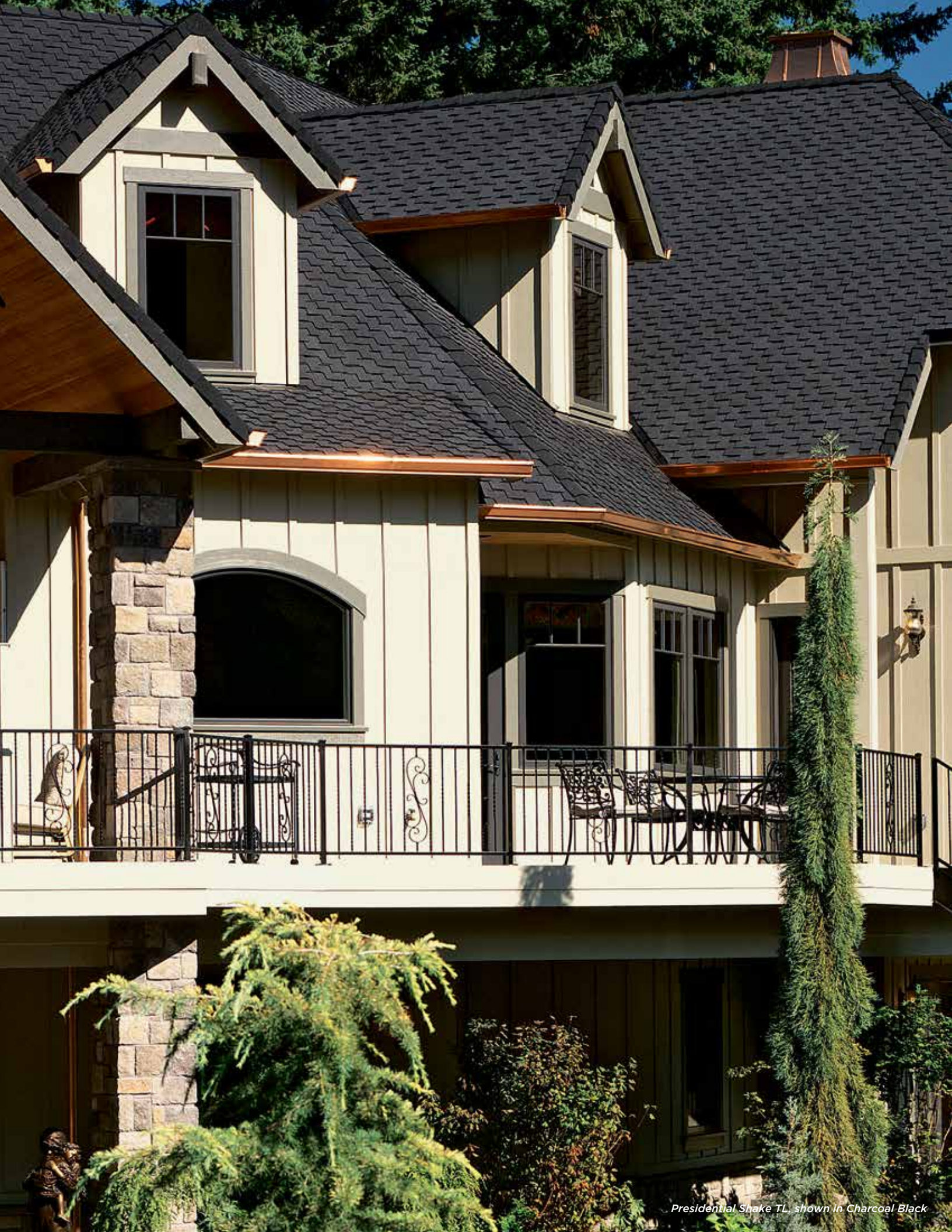
Presidential Shake TL, shown in Charcoal Black