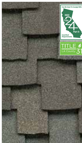
Solaris Country Gray CRRP Product ID 0668-0128