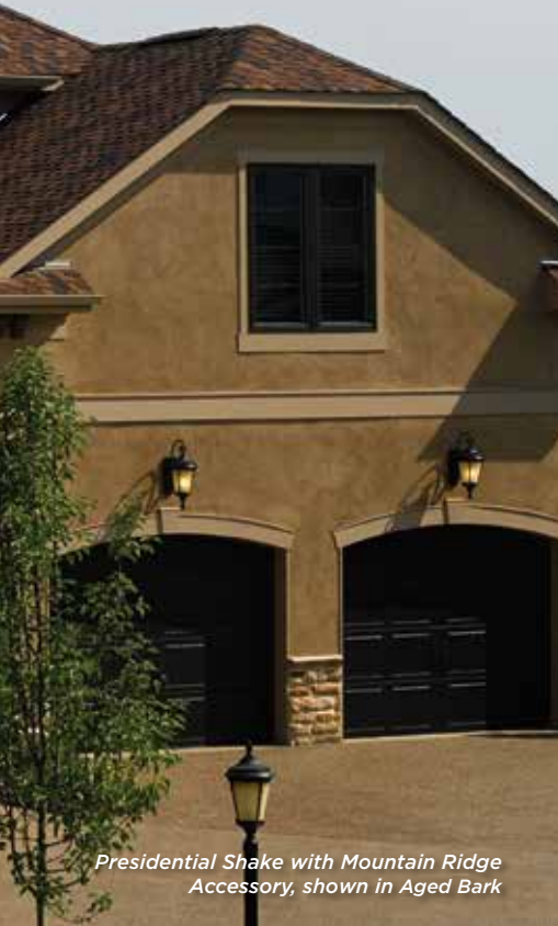
Presidential Shake with Mountain Ridge Accessory, shown in Aged Bark