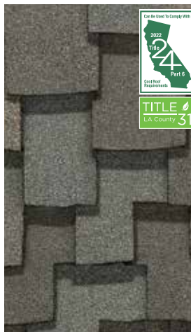
Solaris Country Gray CRRP Product ID 0668-0128