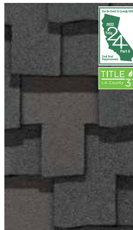
Solaris Shadow Gray CRRP Product ID 0668-0134