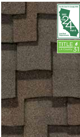
Solaris Autumn Blend CRRP Product ID 0668-0127