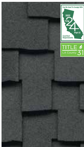
Solaris Charcoal Black CRRP Product ID 0668-0132