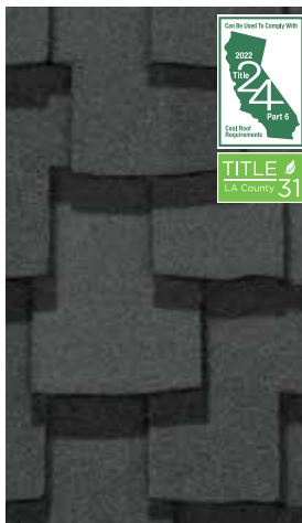
Solaris Charcoal Black CRRP Product ID 0668-0132