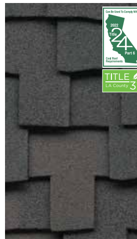
Solaris Shadow Gray CRRP Product ID 0668-0134