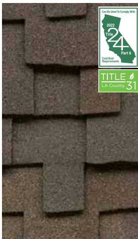
Solaris Autumn Blend CRRP Product ID 0668-0127