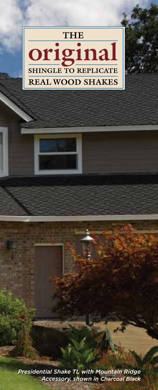
Presidential Shake TL with Mountain Ridge Accessory, shown in Charcoal Black

THE original SHINGLE TO REPLICATE REAL WOOD SHAKES